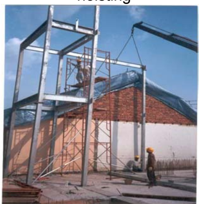
Figure 2.3 Assembly of steel elements in position