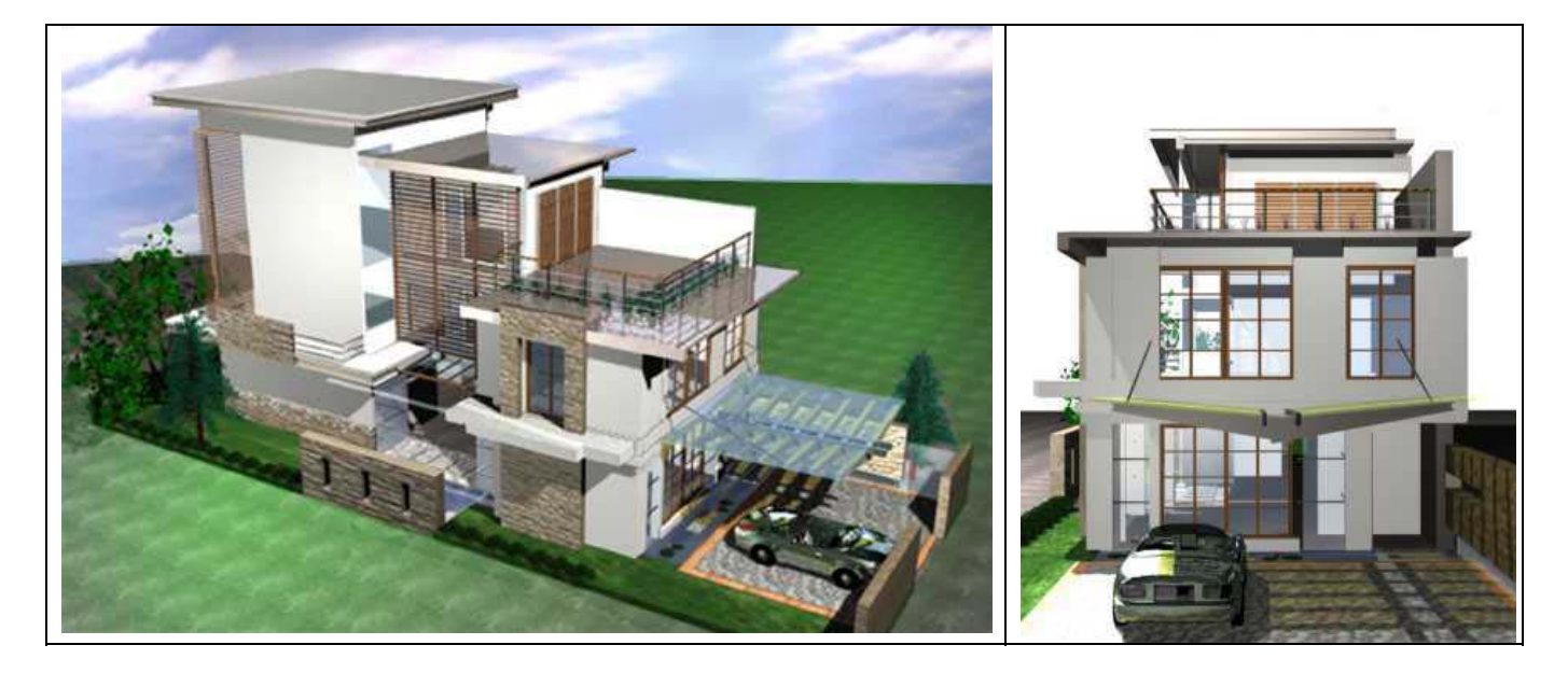
Designed by A-Alliance Architects