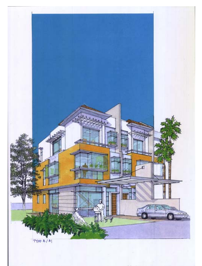
Designed by RSP Architects, Planners & Engineers (Pte) Ltd