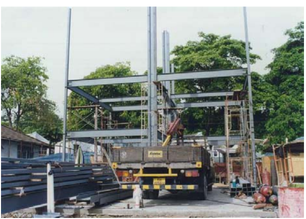
Figure 2.4 Use of lorry crane for lifting of steel elements