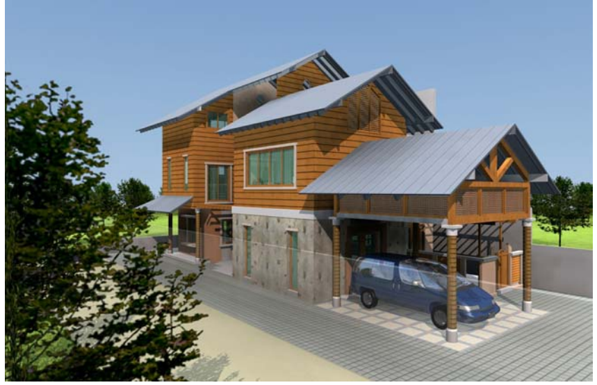
Designed by A-Alliance Architects